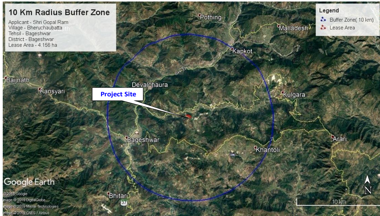
Figure-2. 10 KM Study area