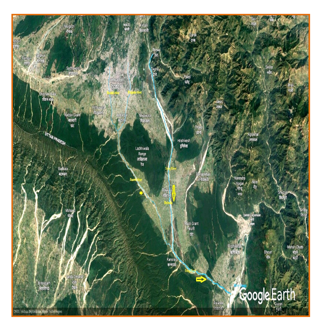
Fig. 1: Google map showing Dehradun City and main river draining in to river Suswa.

From the above water quality data it is apparent that BOD content remains high all the time in River Suswa at Mothrawala, which may be because of municipal wastewater carrying by rivers Rispana and Bindal. Further, BOD content decrease significantly up to 1.0 mg/L in river Song at Birla Guest House. Natural purification as well as dilution of river Song water might have significant role in decreasing pollution load.