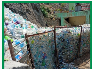
Single use plastic water bottles collected and segregated by Joshimath Nagar Palika Parishad