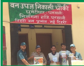
Awareness activity at Patagali, Jakhdar Ghansali Road, New Tehri