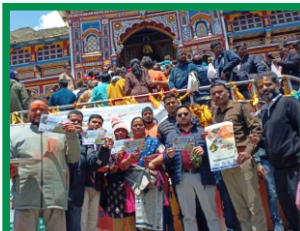
Awareness programme at Badrinath Dham