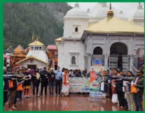
Awareness activity at Gangotri Temple in Rishikesh