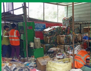
Waste collection and segregation at Tilwara, Kedarnath Road