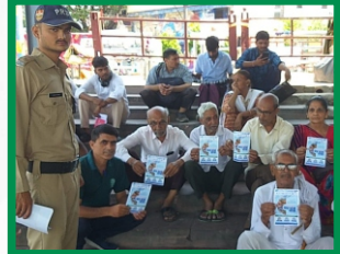
Awareness activity at Triveni Ghar in Rishikesh