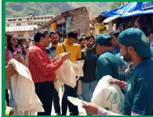
Bag distribution and awareness programme at Badrinath Dham