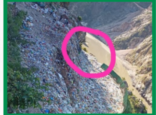
Trash flowing into the Alaknanda river at Rudraprayag