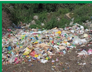
A large area strewn with trash on the outskirts of Rudraprayag town