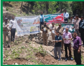
Awareness activity at Hina village in Uttarakashi district