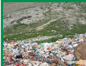
Trash flowing downhill at Agastmuni, Kedarnath Road