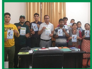
Awareness activity with Nagar Nigam, Sinagar