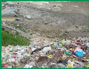
Trash at Agastmuni, Kedarnath Road, Rudraprayag