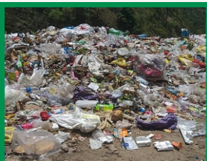
Dumping zone for Ghansali Nagar Panchayat and Chamiyala Nagar Panchayat, Tehri Garhwal