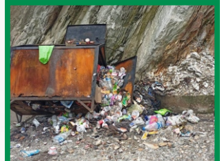
Trash overflowing from the dumping bins at Agastmuni, Kedarnath Road