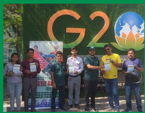
Awareness activity at Dhalwala in Rishikesh