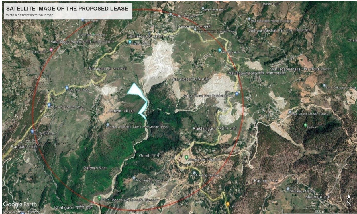
Figure-1: 10 KM Study Area