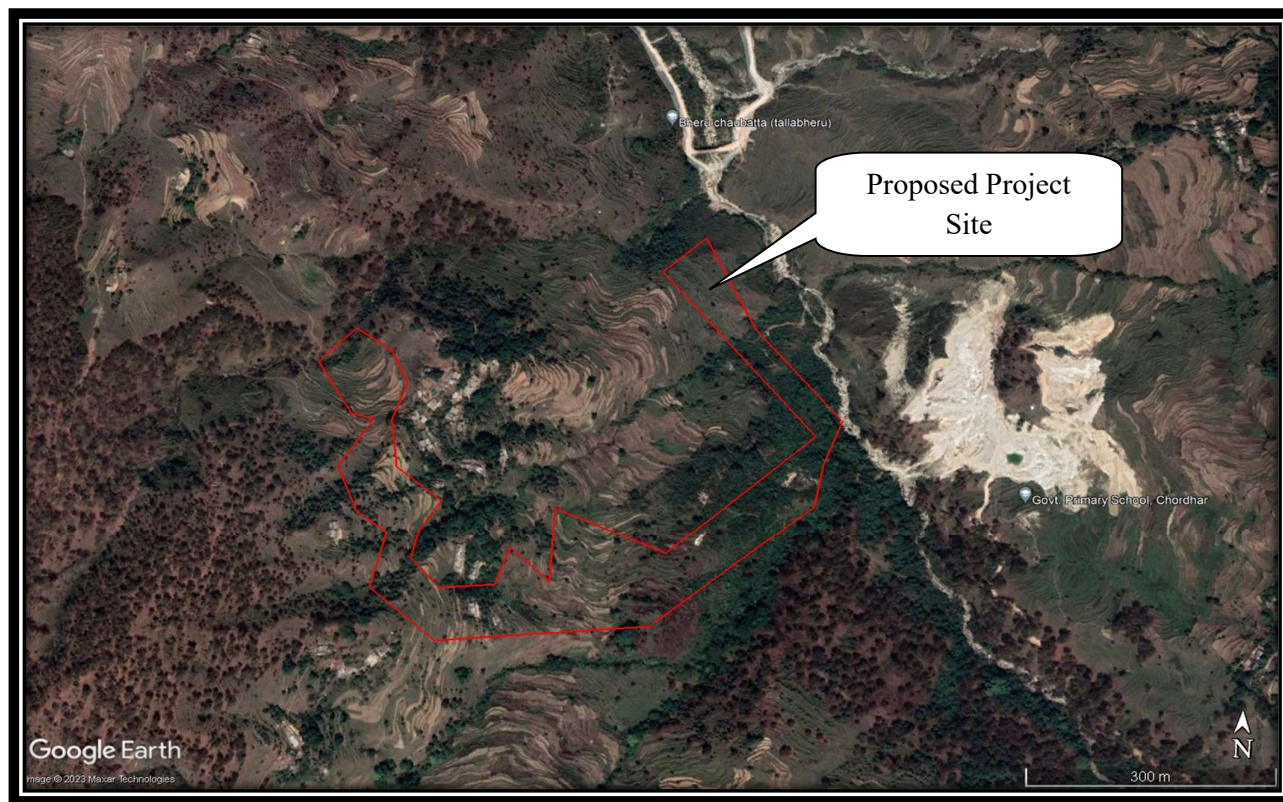
Figure-1: Satellite Image Proposed Project site