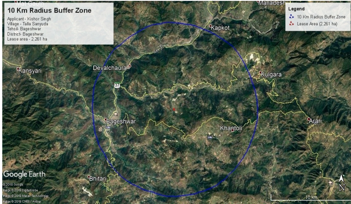
Fig: 2- 10 KM Study area