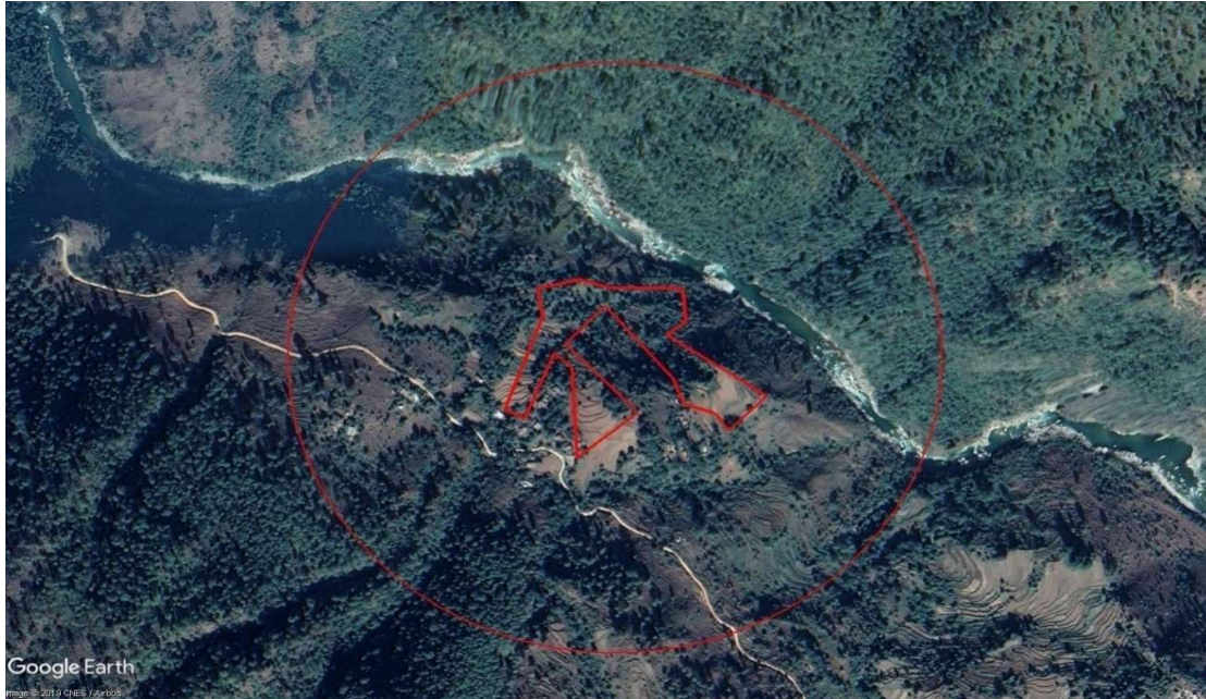
Figure-1: 10 KM Study Area