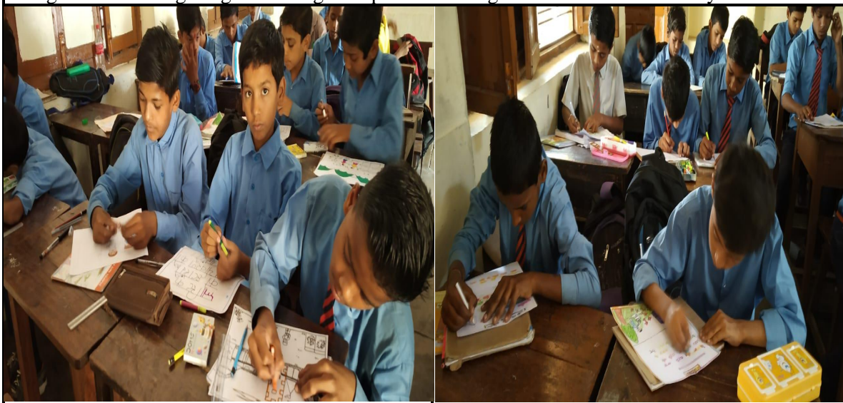
Images for Drawing/Slogan Writing Competition during World Environment Day